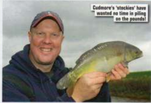
Cudmore's 'stockies' have wasted no time in piling on the pounds!