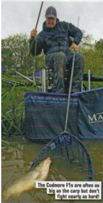
The Cudmore F1s are often as big as the carp but don't fight nearly as hard!

The session has gone brilliantly. I had a plan and stuck to it. Okay, the fish weren't on the bottom down the middle but they were up in the water instead. With bright sunshine, the top few feet of water was obviously much warmer and that's where the fish preferred to be. I've ended up with a good 90lb of carp and F1s and it has made me think again about taking casters for my next match. It just goes to show that something different can sometimes be the difference between catching loads and not so many. Casters are the future!