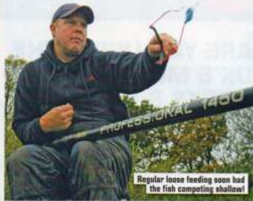
Regular loose feeding soon had the fish competing shallow!